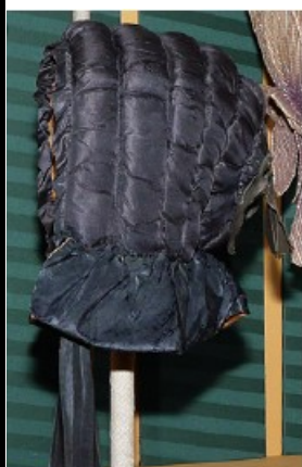
Figure 1. Betsey's bonnet at the Deerfield Museum 2

Imagine walking down the mile-long street of an old Colonial town in the fall when the trees are a riot of color. After admiring the historic houses and photographing the fall foliage, you head to the Historic Deerfield Museum. [Editor's Note: This museum is located in Deerfield, Massachusetts.] When you've finished viewing the paintings, maps, and folk art, you head into the textile gallery. As you're observing the objects (Figure 1), a label catches your attention! The entry reads as follows: