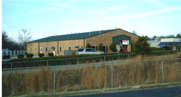
Langston Charter Middle School