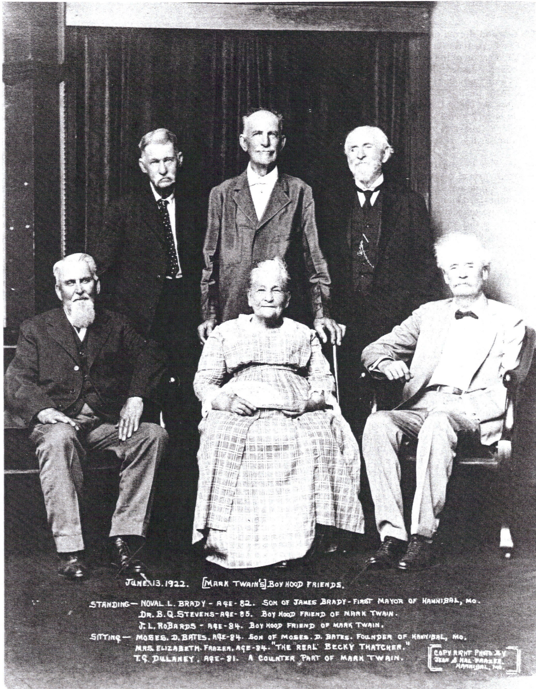
Six boyhood friends of Mark Twain's who still lived in Hannibal in 1922.