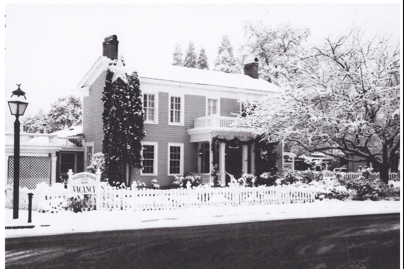
McCully House, Jacksonville, OR