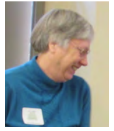
The event was deemed a success by all.