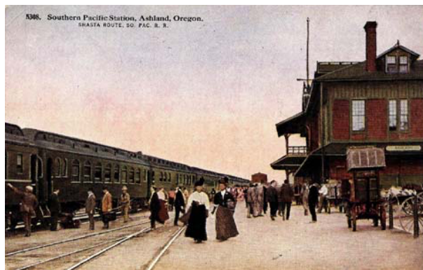
Postcard of "Southern Pacific Station, Ashland, Oregon" from a private collection