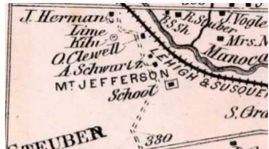
Sample map in HistoryGeo

A new name on our website menu! The RVGS Board approved a year's paid subscription to HistoryGeo , an online map library that features an interactive map within the First Landowners Project database and an Antique Map Collection. Those who attended the Land Grant classes at JCGL will recognize the extent of data available here. You can search by surname and connect to the original Bureau of Land Management document. Not all of the 23 public land states are covered yet, but there is plenty to search at www.HistoryGeo.com