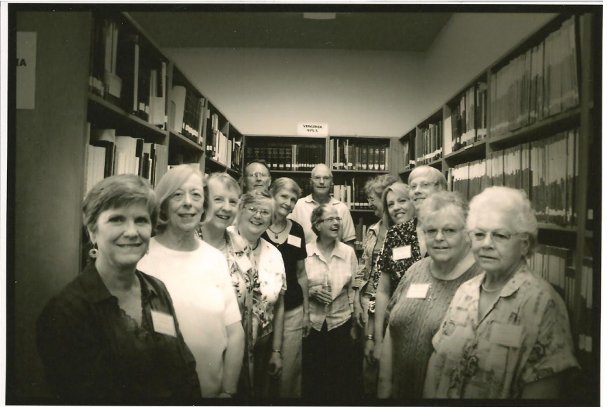
Rogue Valley Genealogical Society, Board of Directors