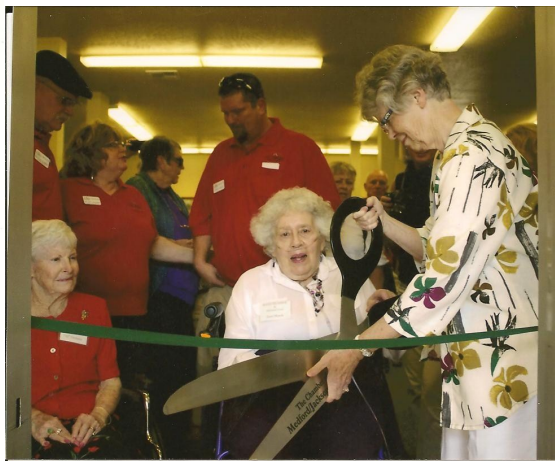
Ribbon cutting ceremony and special guests